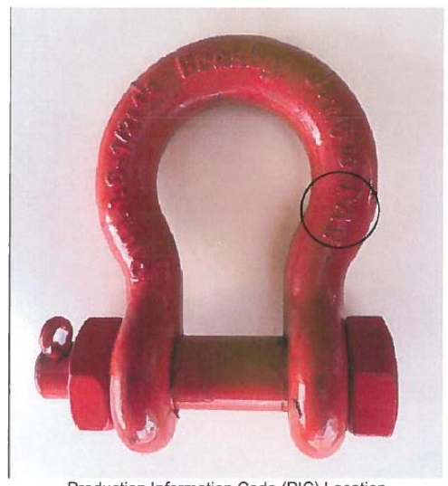
Production Information Code (PIC) Location

By use of the Product Identification Code (PIC) symbols appearing on the shackles, Crosby has determined that the 7/8", 6.5t shackles with the PIC '5VJ' shown on the bow may have this condition. No other sizes or PICs are part of this Important Safety Notice.