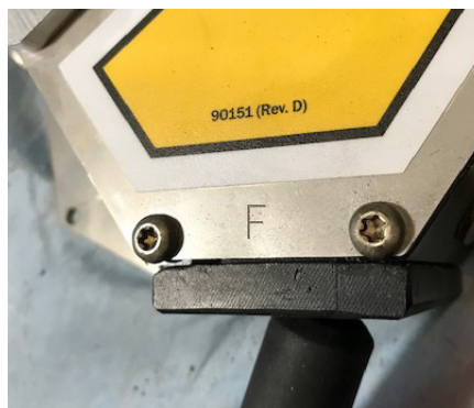
Fig. C - Lower edge of side plate is stamped with "F" - OK for Use