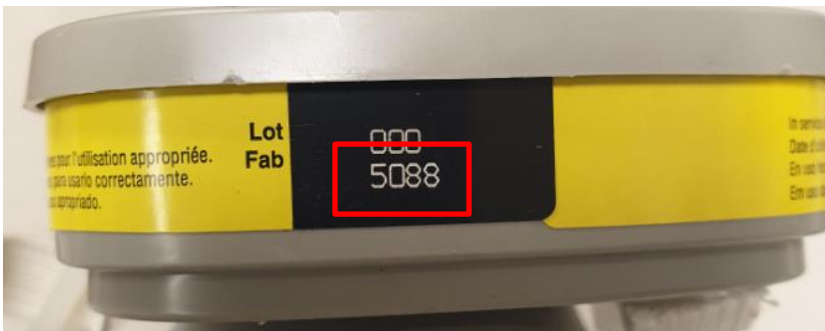
The above respirator is from Lot 5088