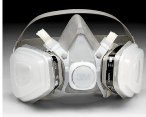
3M Product No. 52P71 3M™ Half Facepiece Disposable Respirator Assembly 52P71, Organic Vapor/P95 Respiratory Protection, Medium 3M ID 70070797181 UPC 50051138660692