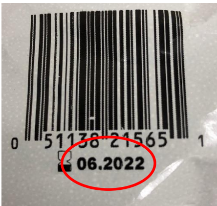
The use-by date above is 06.2022