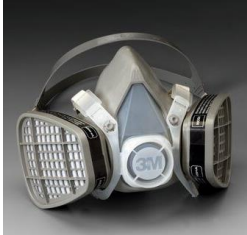
3M Product No. 5201 3M™ Half Facepiece Disposable Respirator Assembly 5201, Organic Vapor, Medium 3M ID 70070314466 UPC 50051138215717