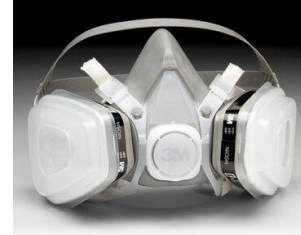
3M Product No. 07192 3M™ Paint Spray Respirator 07192, Medium 3M ID 70070797868 UPC 00051131071926