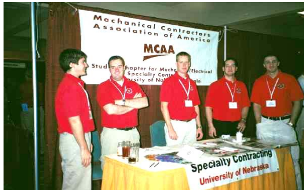
University of Nebraska – Lincoln is 2001 MCAA Student Chapter of the Year

Students spent Tuesday morning meeting, greeting, and talking with a flood of contractors about career hopes and plans. Resumes and business cards were exchanged, formal interviews were arranged, and employment opportunities were offered and weighed.