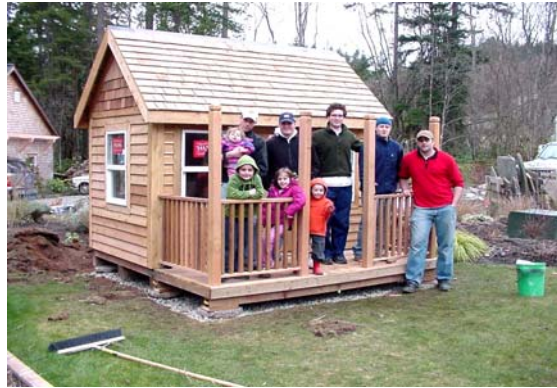
University of Washington MCAWW Chapter members and helpers inspect their handiwork

students spent many weekends getting the playhouses built and ready for auction (see photo below)