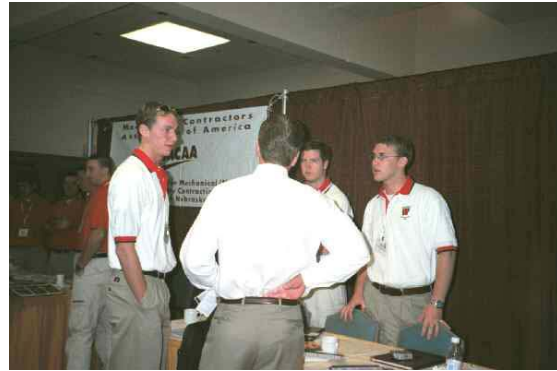
University of Wisconsin-Madison students talk about career goals with a contractor at chapter exhibit

The students met with prospective employers at the Manufacturer/Supplier Exhibit, networked with other students at the student events, and enjoyed the entertainment and social events as well. Who said launching a professional career was tough!