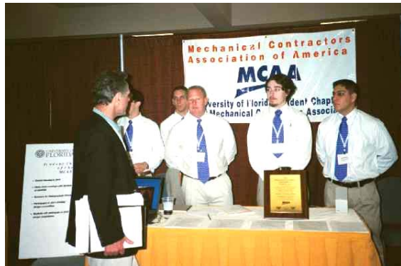
Members of the University of Florida Student Chapter of the Mechanical Construction Association talk with a contractor about their plans for the future.

What a great way to get acquainted with an industry!