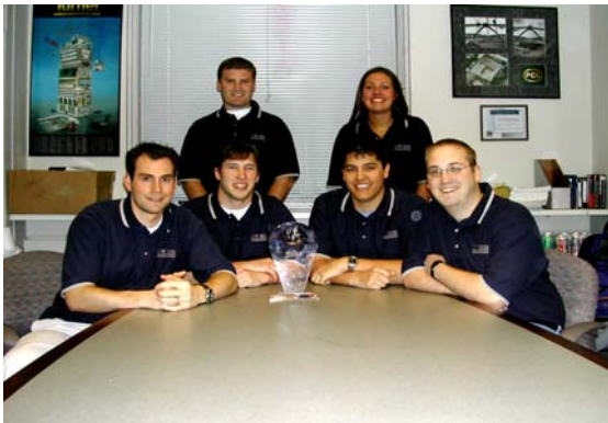
University of Washington team takes first prize in MCAA's 2001 Student Competition

The University of Washington team won first prize for its submission to the 2001 Student Chapter Competition ; the