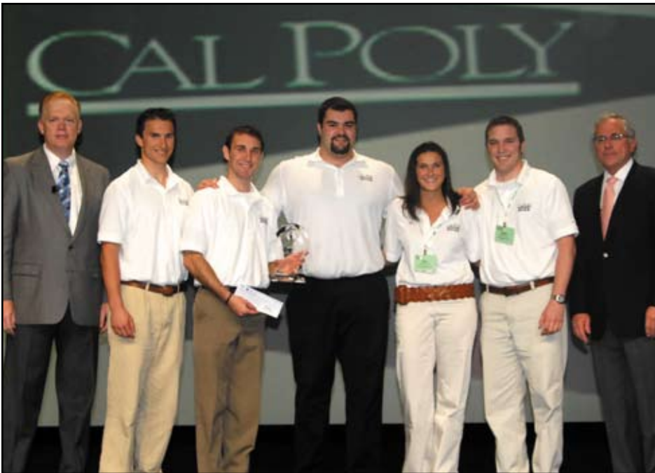
The Northern California MCA Student Chapter at California Polytechnic State University, San Luis Obispo took first place in MCAA’s 2006 – 2007 Student Chapter Competition.

Congratulations to Cal Poly at San Luis Obispo and all the finalists. Thanks again to the 20 chapters that participated in this year’s competition. ☺