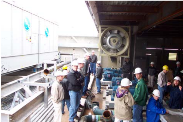
Virginia Tech students tour John J. Kirlin jobsite that was the subject of the competition