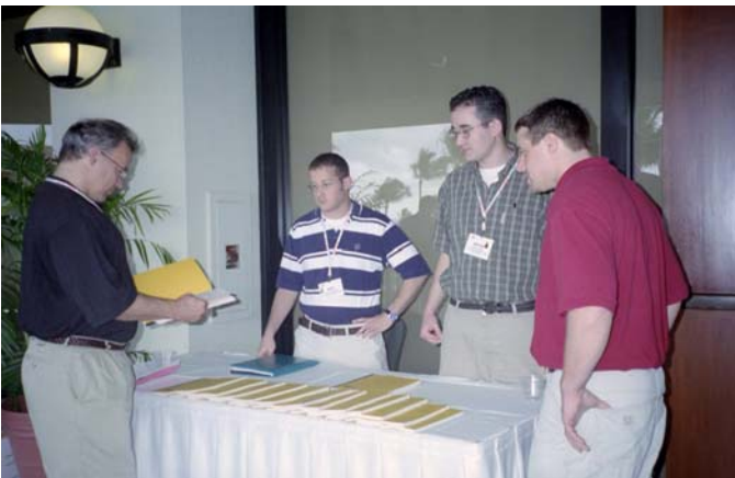
Purdue University students talk with a contractor about career opportunities