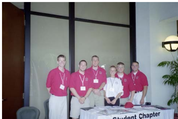
U of N-L students at MCAA 2001 in Maui, Hawaii

The students also benefited from a number of outstanding tours, including the