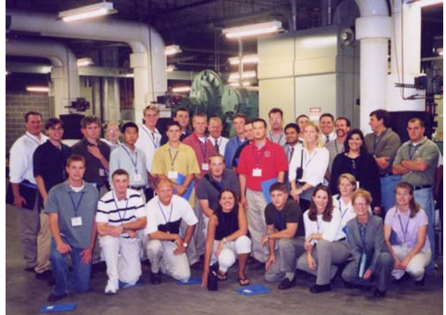
Participants at MCAA's first Student Chapter Summit in Kansas City, Missouri,