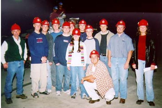
Students who toured Omaha's new geodesic dome

Nebraska was invited by the Mechanical Contractor's Association of Omaha to tour the new Desert Dome at the Henry Dorley Zoo in Omaha, Nebraska. The Desert Dome will be the largest indoor desert environment in the United States and is housed within the largest geodesic dome in the United States. It is scheduled to open in March of 2002.