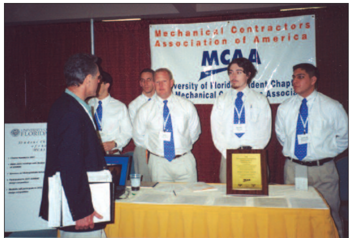
The University of Florida's Student Chapter exhibiting at the 2002 MCAA Annual Convention in Boca Raton, Florida.

Unlike some other national association student chapter programs, members pay no fee to MCAA for participating in one of its student chapters. However, chapters may decide to set membership fees to help defray expenses.